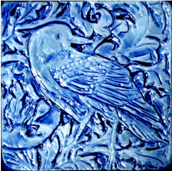
The Raven inspired by Morris's Forest Tapestry in cobalt blue glaze (shiny). 2012