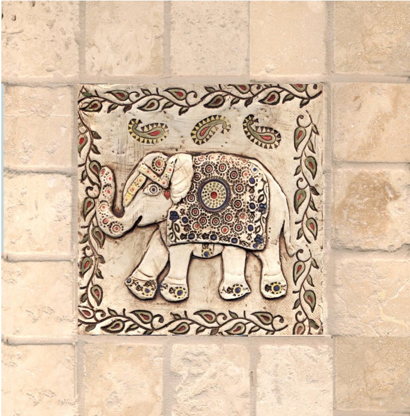
Six Inch Happy Elephant -- A new addition to our award winning "Yoga Tile" Collection . First shown at 2012 Coverings -- created 2011.