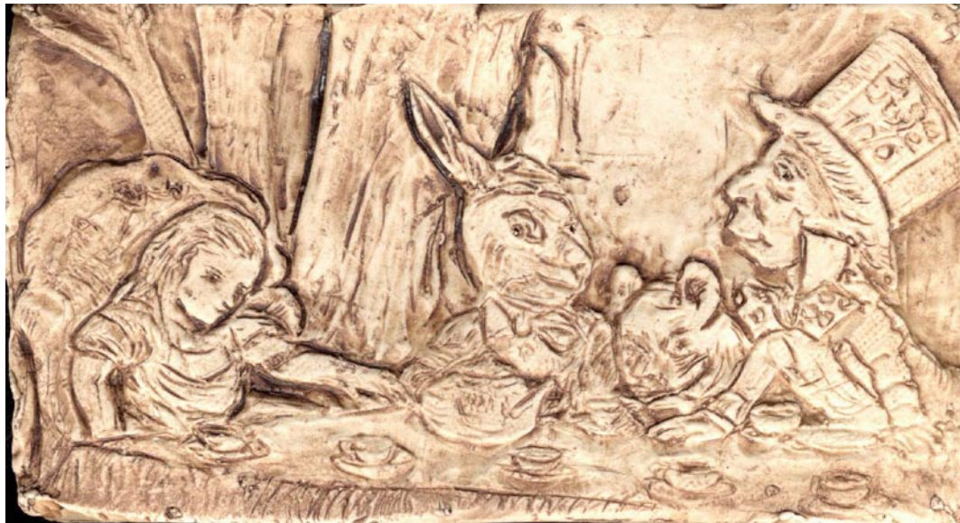
The Tea Party -- based on John Tenniel's illustration for Alice In Wonderland. First created in 2008 -- first shown at Coverings 2013.