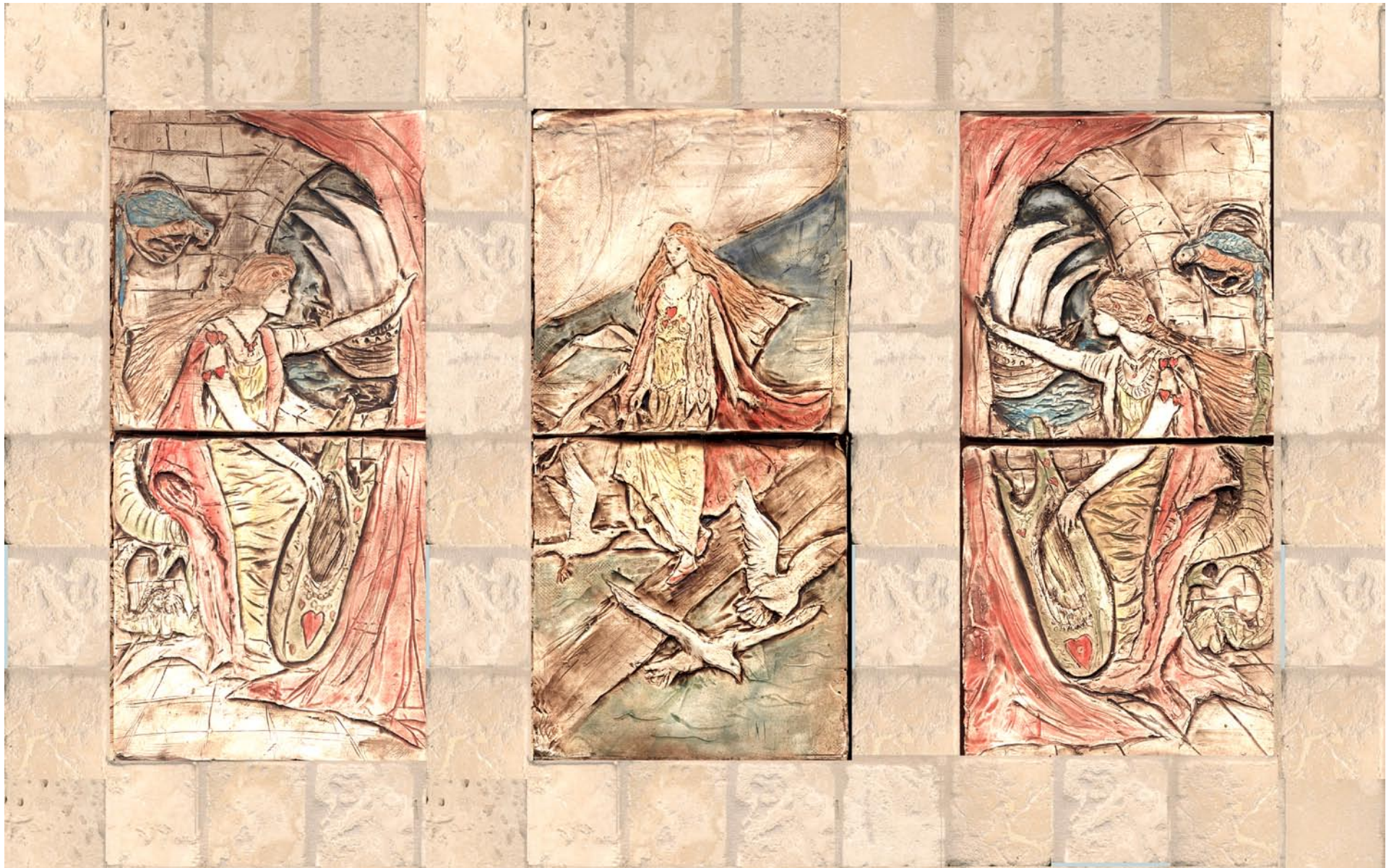
The Princess Waiting Murals in color and the The Princess and the Birds, also inspired by an illustration by H.J. Ford from the 1902 Andrew Lang Crimson Fairy Book. Each mural is composed of two six inch porcelain tiles. The color stains are fired on and will not come off. The Princess and the Birds is also available in brown stain, Created 2012