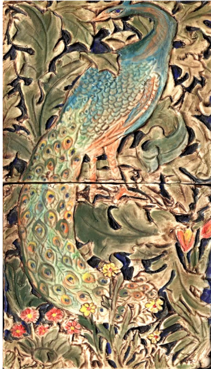
Inspired by Morris's Forest Tapestry this two tile Peacock is 4 x 8" (Two 4 x 4" tiles). Shown in matte fired on ceramic stains.